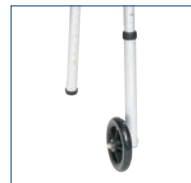
Rear Glide Caps Standard On Walker With Wheels

ProBasics Two-Button Release Folding Walkers provide maximum strength in a lightweight aluminum design, all backed by a limited lifetime warranty. Ample height adjustment options coupled with a two-button folding mechanism make ProBasics Folding Walkers easy to use and accommodating to the most demanding patient needs. Available with or without 5" wheels and in junior or adult sizes. Supports patient weights up to 300 pounds.