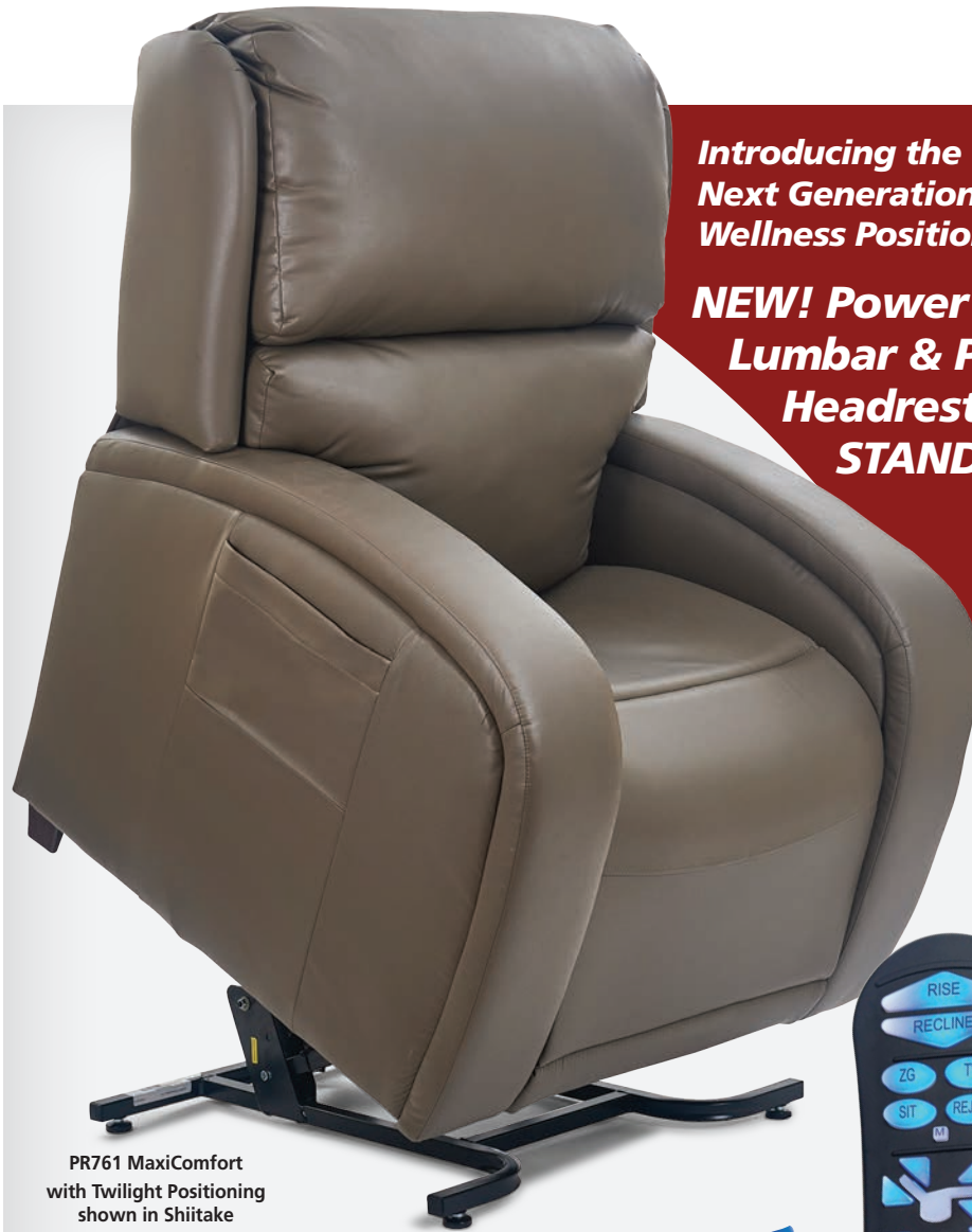
PR761 MaxiComfort with Twilight Positioning shown in Shiitake

Introducing the Next Generation of Wellness Positioning