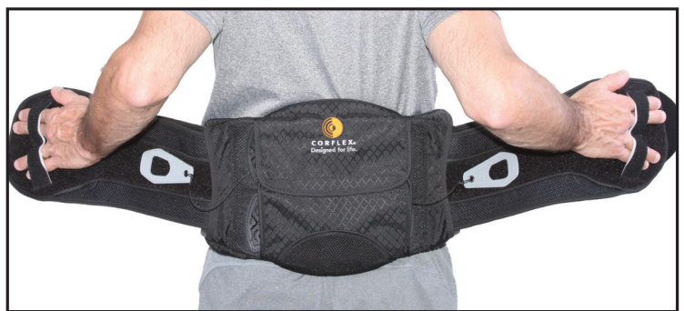
1. Center the back panel on the lower back.

2. Slide fingers through the loops on the belt ends to assist with application.