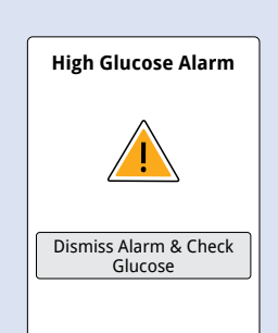
Touch Dismiss Alarm & Check Glucose or press the Home Button to dismiss alarm and check your glucose.